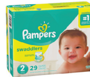
DIAPER WRAP PACKAGING (NO DIAPERS NEW OR USED)