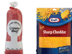
MEAT & CHEESE BAGS