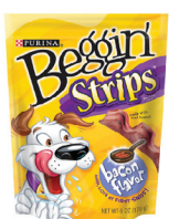
PET TREAT POUCHES