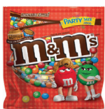
SNACK FOOD POUCHES