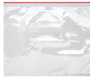
FOOD STORAGE BAGS