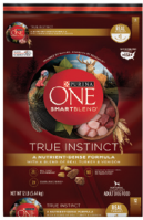
PET FOOD BAGS

Flexible packaging from these products can now be recycled. Use the list as a guide and stop throwing away what now can be recycled. All these packaging types can be placed in your recycling toters for recycling.