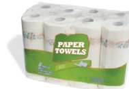
PAPER TOWEL OVERWRAP