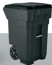
Trash Collection: Once a week in your zone