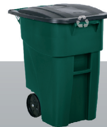
Recycling Collection: Once a week in your zone